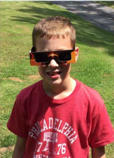
Students of St. Monica School enjoying the eclipse on August 21 st .