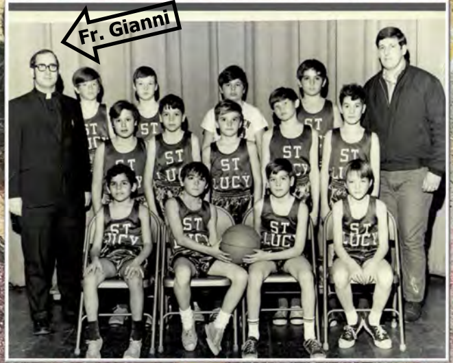
A Blast From the Past - Photos from the St. Lucy Basketball Team (around 1970)