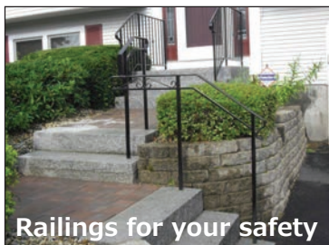
Railings for your safety