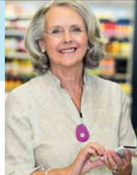
GPS Mobile Above

No Contract • No Fees • Easy Setup • md-medalert.com CALL 800-890-8615