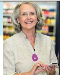
GPS Mobile Above

No Contract • No Fees • Easy Setup • md-medalert.com CALL 800-890-8615