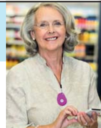
GPS Mobile Above

No Contract • No Fees • Easy Setup • md-medalert.com CALL 800-890-8615